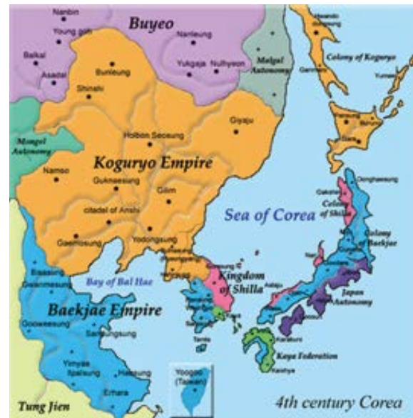
map of the ancient 4th century, which was documented in Handangogi