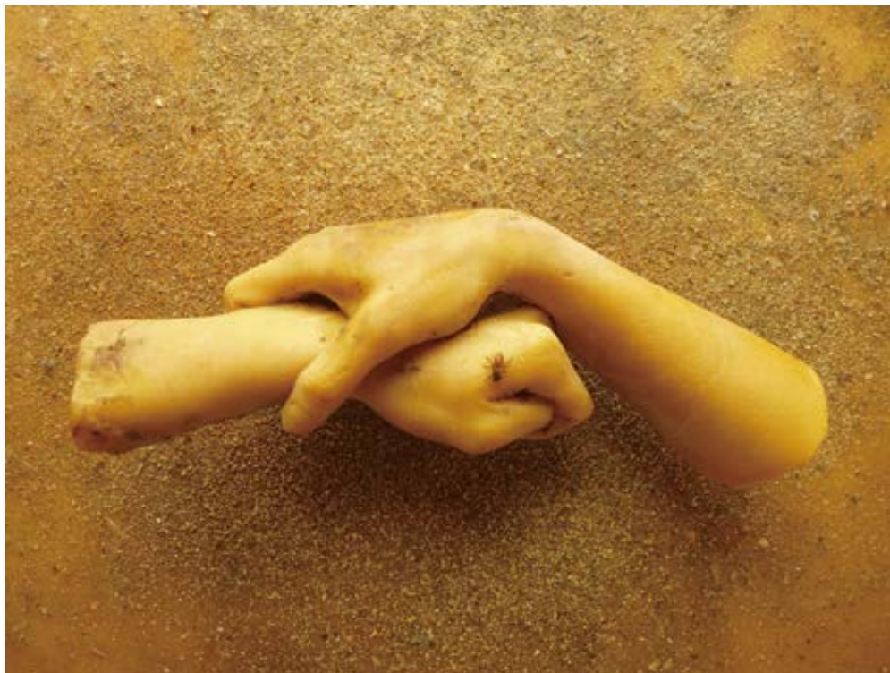
Bee Chapel par l'artiste Terrence Koh